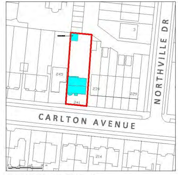
EXISTING SITE LOCATION PLAN SCALE 1:2500