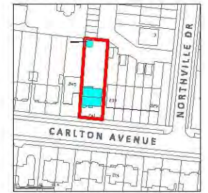
EXISTING SITE LOCATION PLAN SCALE 1:2500